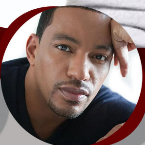
LAZ ALONSO PRODUCER AND ACTOR (AVATAR, FAST & THE FURIOUS, AND WRATH OF MAN)