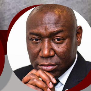
BEN CRUMP CIVIL RIGHTS LEADER, ATTORNEY, AUTHOR, AND MEDIA INFLUENCER