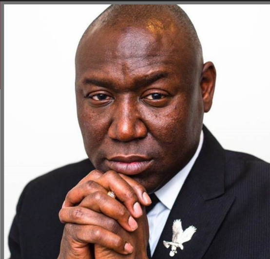
A Conversation with Ben Crump Civil Rights Leader, Attorney, Author, and Media Influencer