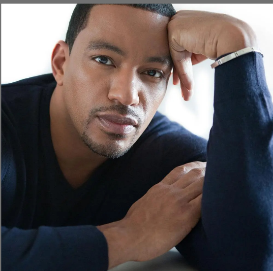
Fireside with Laz Alonso Producer and Actor