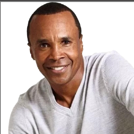
A Fireside Chat with: Sugar Ray Leonard