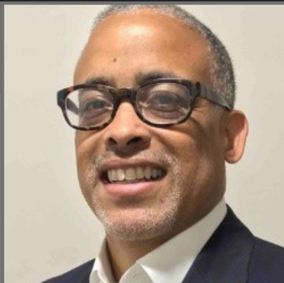
Interviewer for Fireside Chat with Ben Crump