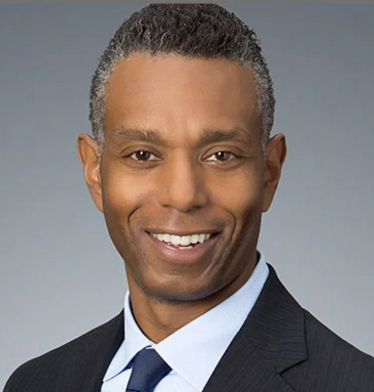
Interviewer of Fireside Chat with Laz Alonso