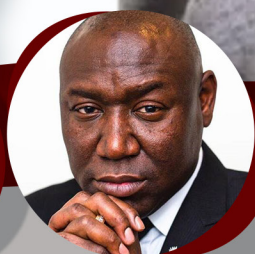
BEN CRUMP CIVIL RIGHTS LEADER, ATTORNEY, AUTHOR, AND MEDIA INFLUENCER