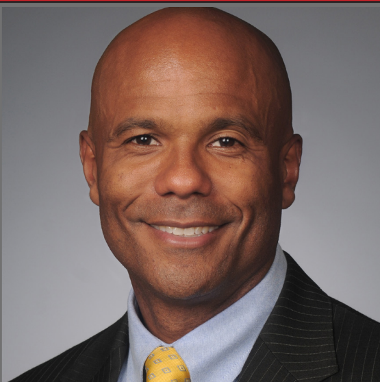
Moderator of Men of Color: Accelerating Your Impact by Serving on Corporate Boards