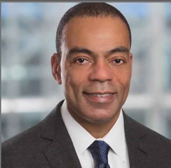
Men of Color: Accelerating Your Impact by Serving on Corporate Boards