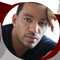
LAZ ALONSO PRODUCER AND ACTOR (AVATAR, FAST & THE FURIOUS, AND WRATH OF MAN)